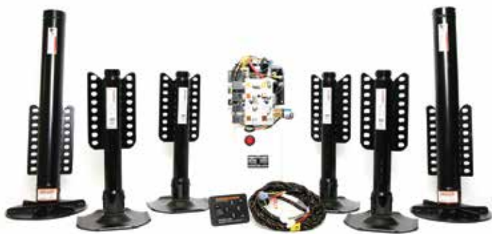
EQ SMART-LEVEL FIFTH WHEEL SIX POINT SYSTEM